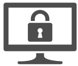
Dark Web Monitoring

When you choose to open an Assured Club checking account, you are choosing a suit of armour for your account. You can sleep easy knowing you're extra protected against online lurkers. That's just one of the many benefits!